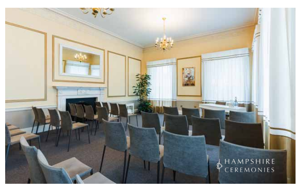
Basingstoke Registry Office

The War Memorial Park which is within walking distance has beautiful locations for your memorable photographs.